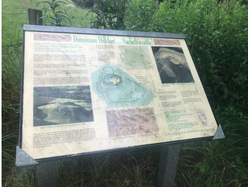
Figure 1. Placard at the base of Dunsinane Hill. Perth and Kinross Heritage Trust.